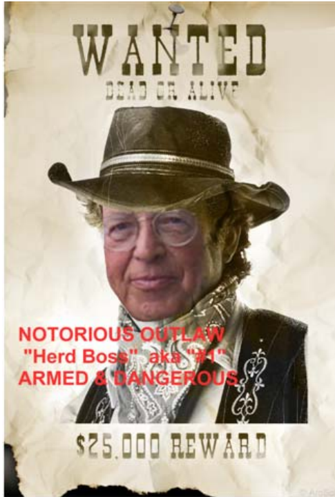
By Terry Morgan

I'm sure you have probably seen it at least one time in your life. A good man (or woman) gone bad. This unfortunate happenstance can happen in many different ways but is normally associated with money, job, intemperance in the use of intoxicants, smoke, intimate indiscretions, snobbery, and many other mental and emotional anxieties. But the absolute worst scenario that I can imagine evolves around the person who is pretty good at one sport and then suddenly tries to switch to another sport with the hope that he (or she) can carry with them the superiority they have built in the first sport, over to the second sport. It is a horror to watch them demeaning themselves with excuses for their pitiful attempts to succeed; and then- abject failure.